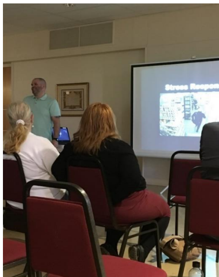
SAFETY CLASS APRIL 6, 2019