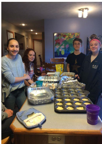
SHORTYites baking for Open Doors

Wishing everyone a very happy, healthy, and peaceful 2019!